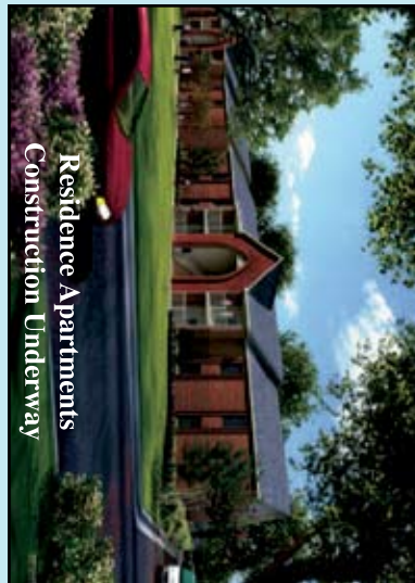
Residence Apartments Construction Underway