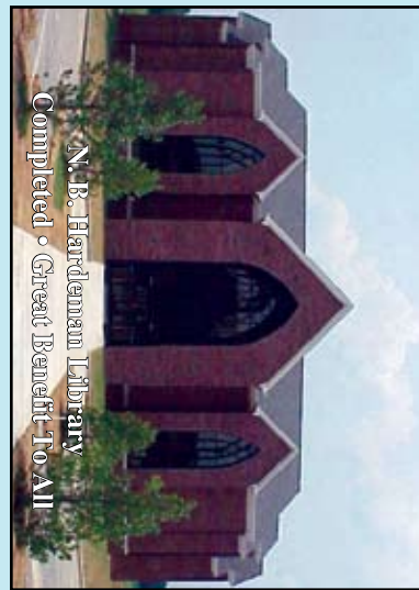
N. B. Hardeman Library Completed • Great Benefit To All