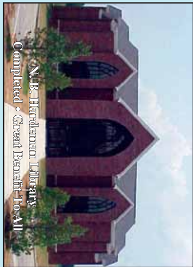
N. B. Hardeman Library Completed • Great Benefit To All