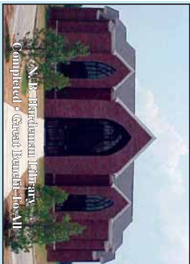
N. B. Hardeman Library Completed • Great Benefit To All