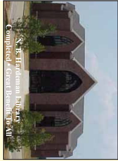
N. B. Hardeman Library Completed • Great Benefit To All