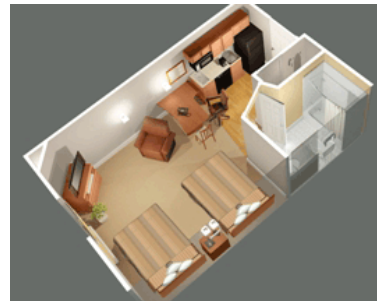
Two Bed Studio Suite