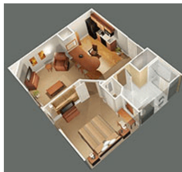
One Bedroom Suite

You can get the Studio Suite or the Two Bed Studio Suite for a special MSOP lectureship rate of $59 plus tax . Or you can get the one bedroom Suite which includes a sofa sleeper, an extra tv and closet space for $79 plus tax a night. Alumni will need to reserve their room by March 15 th for these special rates. Please call their direct number at 901-755-0877 and reserve your room for the lectures at the special MSOP rate. I just did!